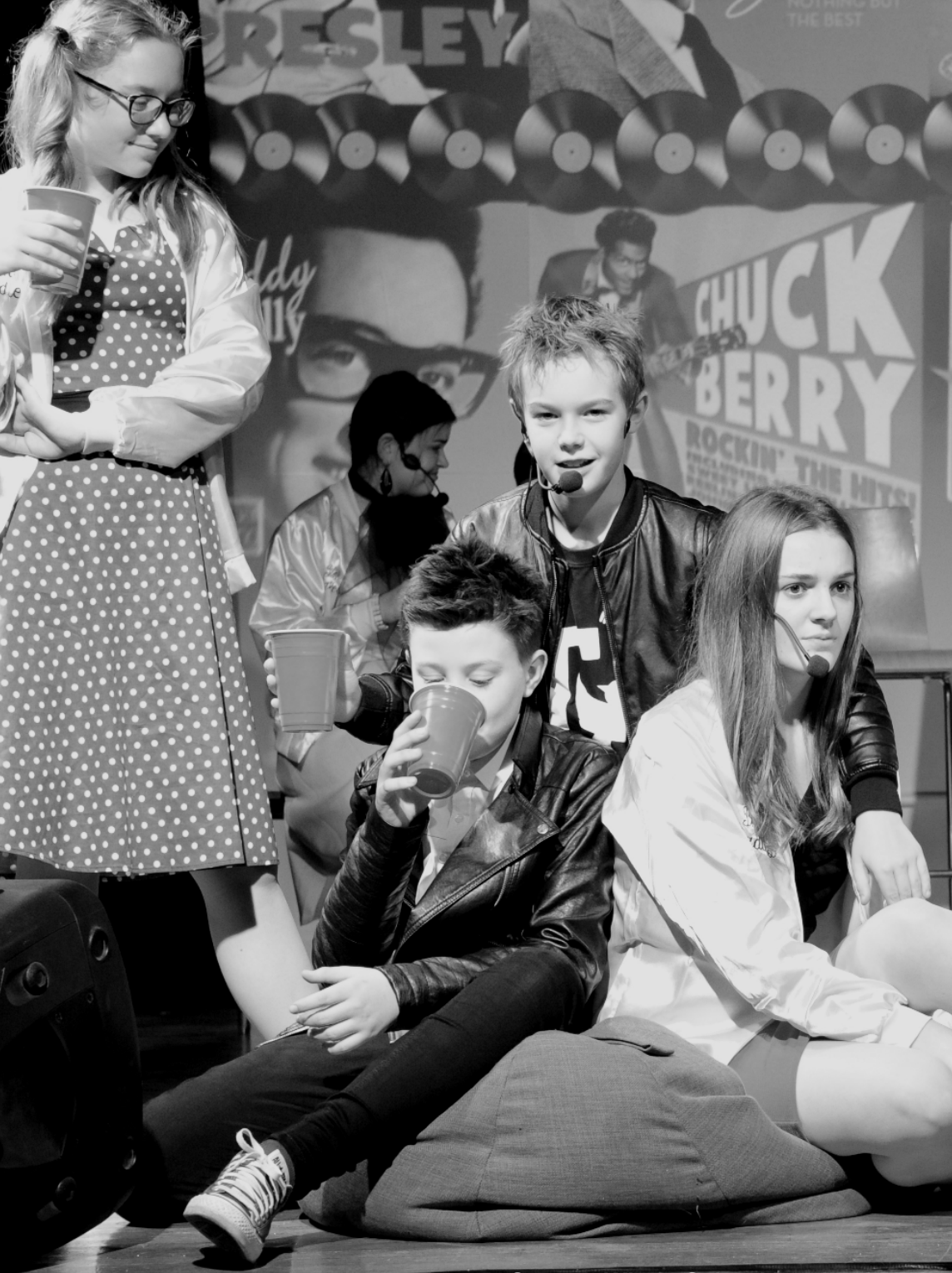
Grease, Whole School Production