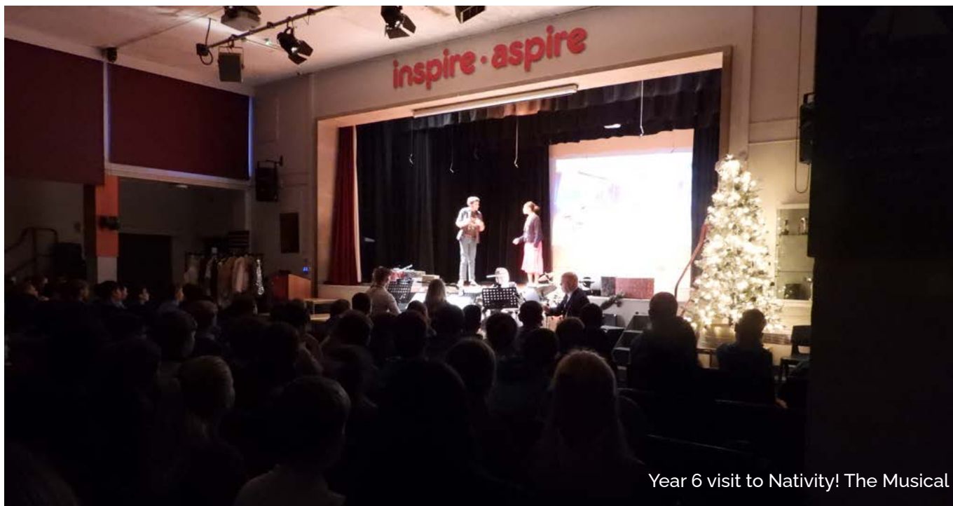
Year 6 visit to Nativity! The Musical

Merry Christmas to all families celebrating over the break! The autumn term can feel very long for students (and staff) so it has been great to end the busy term with a number of fun activities including: Nativity – The Musical , the Christmas Fair, lunchtime bingo, karaoke and orienteering. In addition to these events, we have recognised students' brilliant achievements in assemblies, celebrating excellent attendance and positive behaviour and launched the reward visits with students.