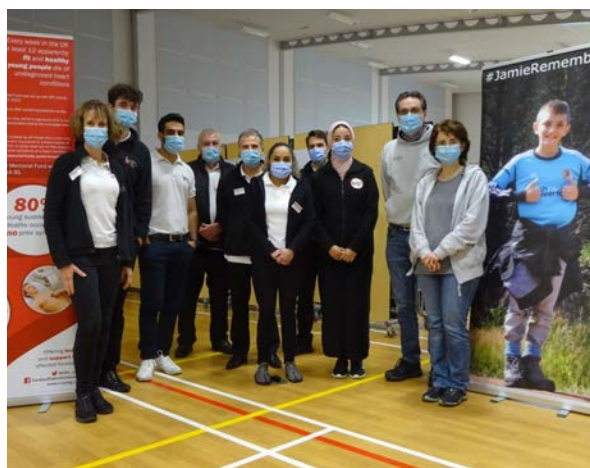
Community: Pages 11-14